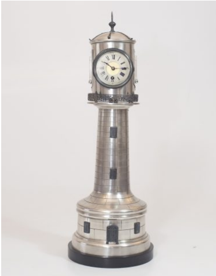
An antique clock automaton from c.1890, by Guilmet - part of his industrial clock collection