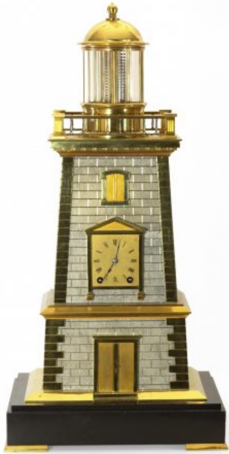
Antique clock automaton by Guilmet, France